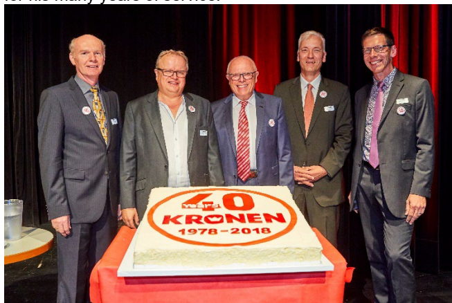
The management team was expanded in the anniversary year 2018.