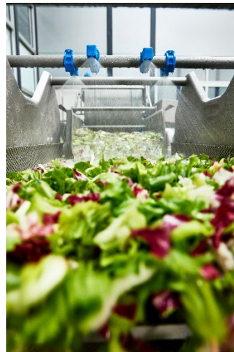
The line processes cut salad.