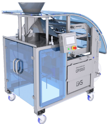
The FLEX M packaging machine packages the ready-to-eat salad in bags.