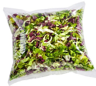
The salad is portioned and packaged in bags.